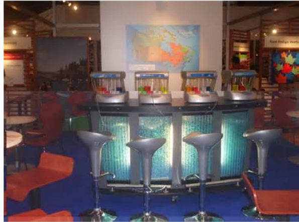
[Darling Harbour, Sydney, Australia]

Yaakov 1.15 when sin is fully grown, it gives birth to death.