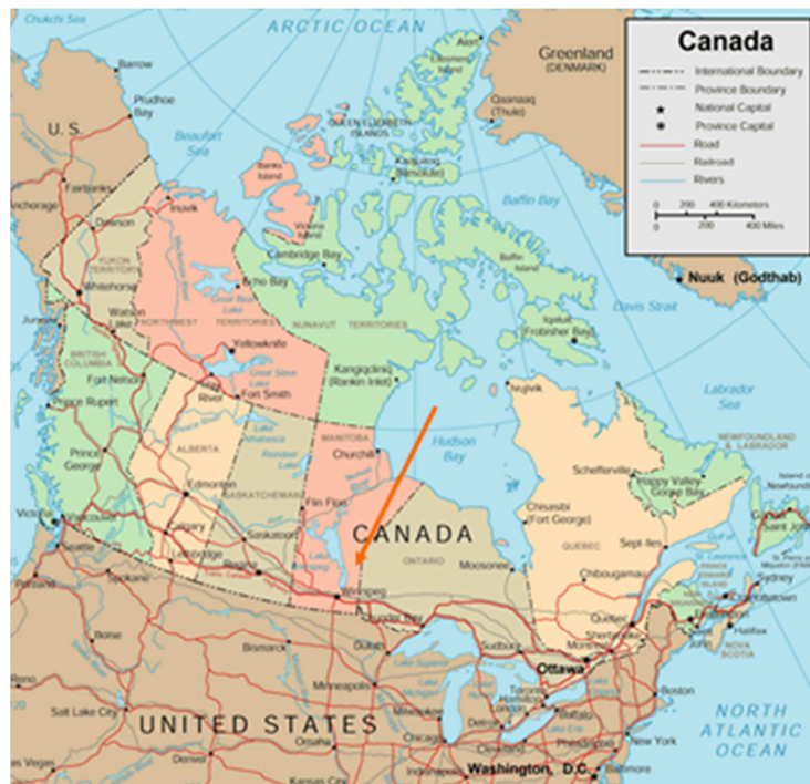
Illustration of this from our 6 years in Winnipeg, Manitoba, Canada.]

[Gets to be -40° F [F and C come together that cold] Nevertheless, large city.]