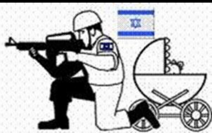
A soldier of Israel