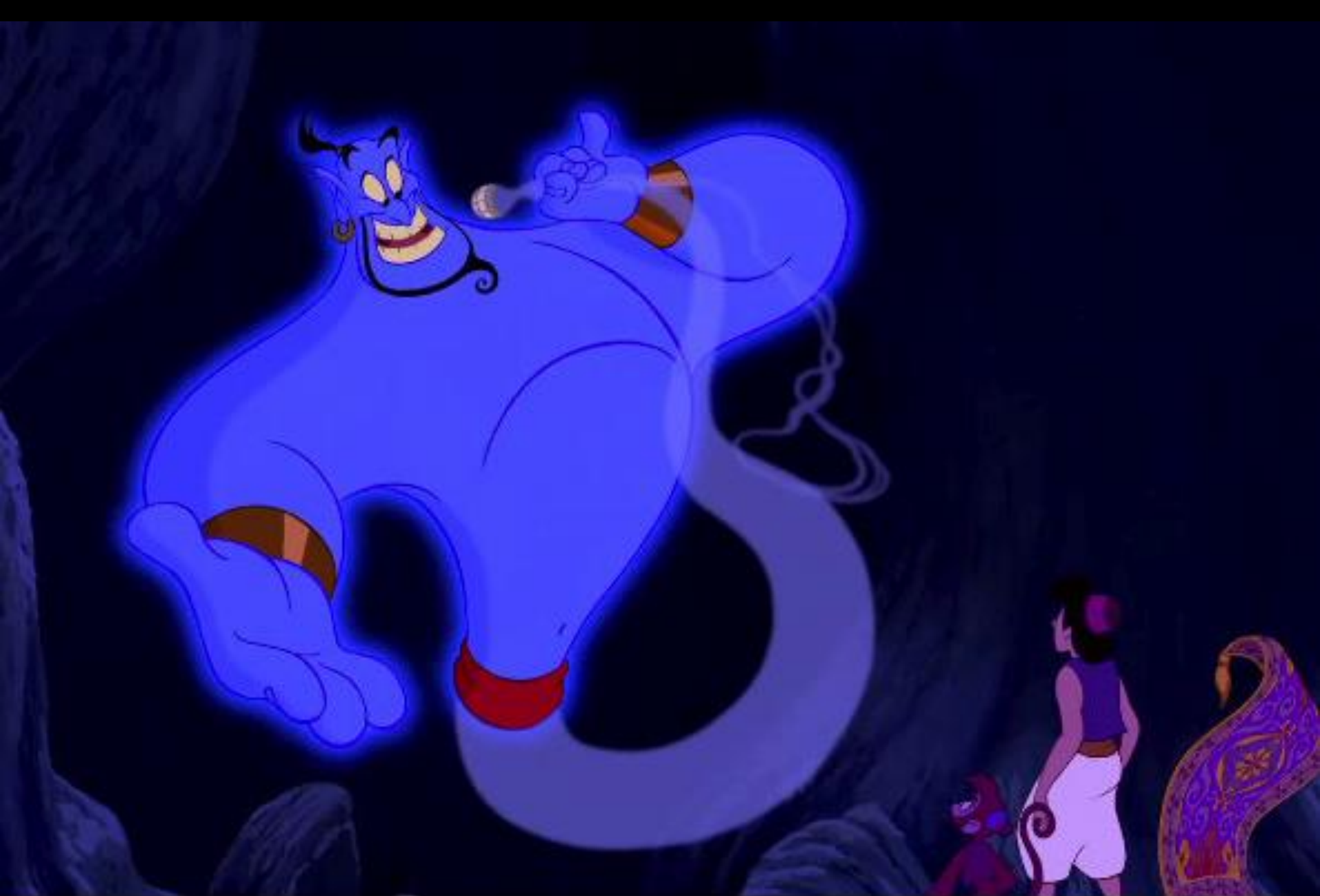
Iranian Concern Over Israeli Sorcery