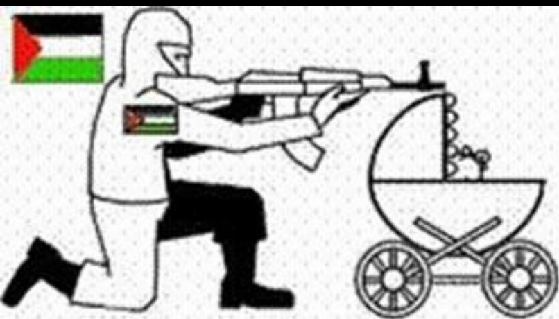
A soldier of Palestine