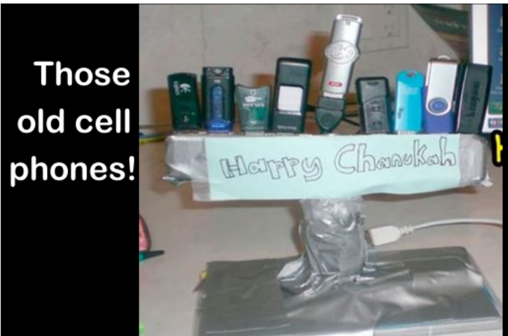
Those old cell phones!