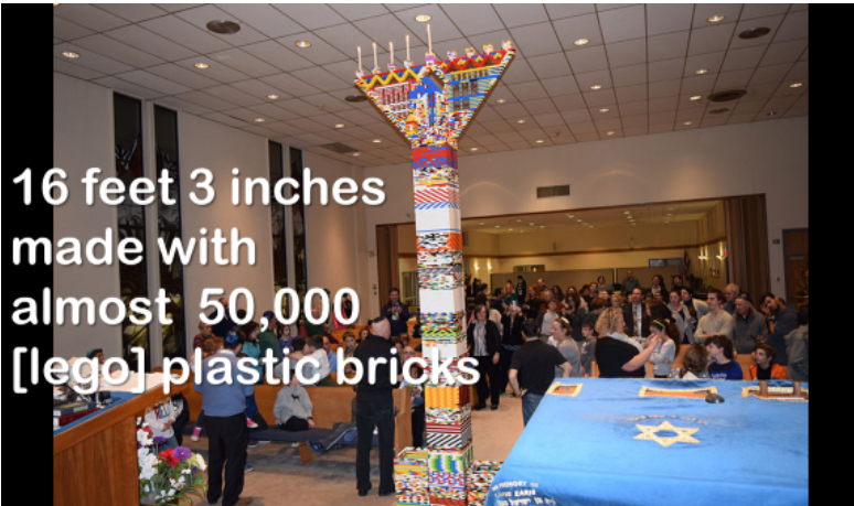
16 feet 3 inches made with almost 50,000 [lego] plastic bricks