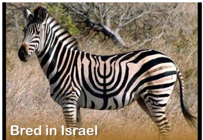
Bred in Israel