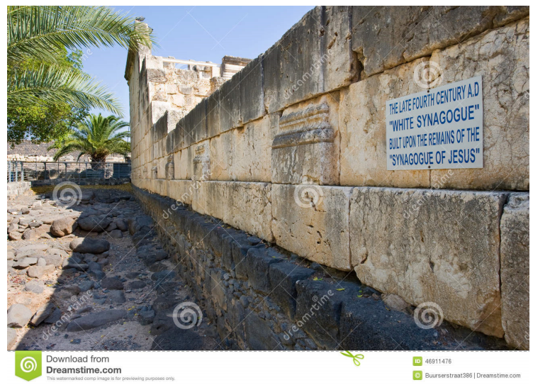
[White synagogue imported marble 300's. Below is local volcanic black basalt.]

Yn 6.66-71 From this time, many of His disciples left and quit walking with Him. Yeshua said to the Twelve, “Don’t you want to leave too?” Shim’on Kefa answered him, “Lord, to whom would we go? You have the word of eternal life. We have trusted, and we know that you are the Holy One of God.”