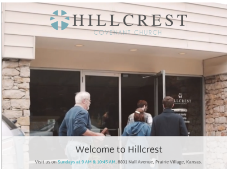
[Hillcrest Covenant Church, 8801 Nall Ave.