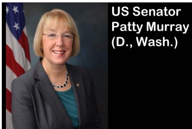
US Senator Patty Murray (D., Wash.)

The bill also mandates that medical treatment to attempt to save the child's life also be provided. Sen. Sasse had originally called for "unanimous consent," a parliamentary procedure that would have expedited the bill's passage through the Senate,