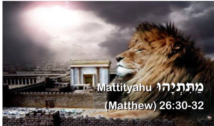
מַתִּיָּהוּ Mattityahu (Matthew) 26:30-32