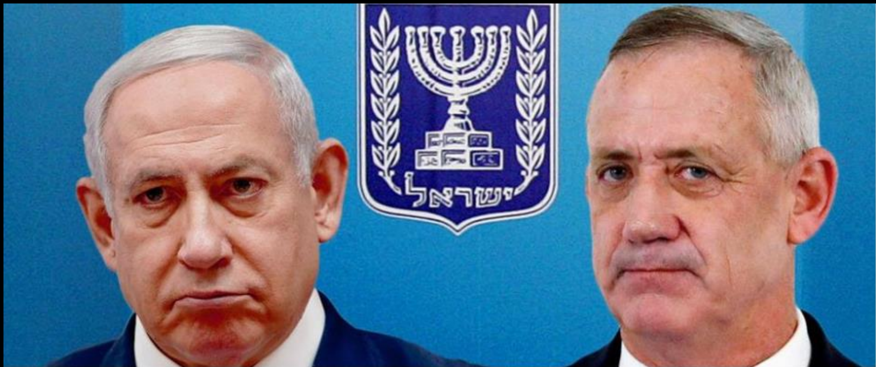
Benjamin Netanyahu and Benny Gantz