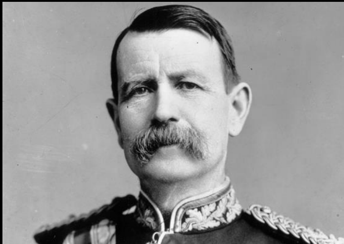
Charles Warren 1840-1927