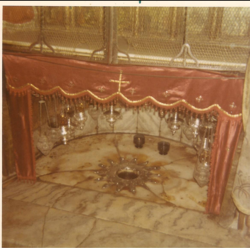
Photo of the silver star surrounding the viewing hole over the cave floor where Yeshua was likely born.