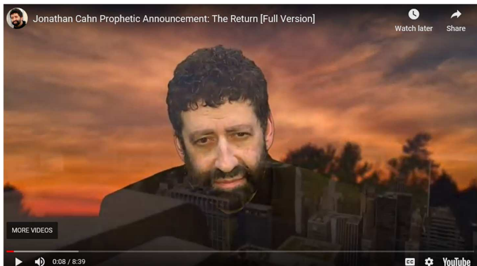
Jonathan Cahn – The Return video, a movement set for September during the High Holidays

[ https://www.christianpost.com/voices/christianity-is-growing-faster-than-any-time-in-history-why-is-the-church-in-europe-america-declining.html ]