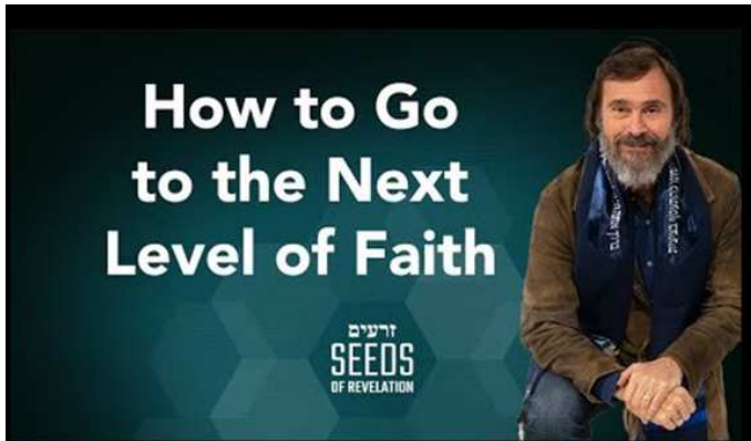
2.5-minute video – https://youtu.be/dVtbWtN9-zA

Can you commit to that as a belief, as a grid, as an emotional bottom line? "I don't feel it."