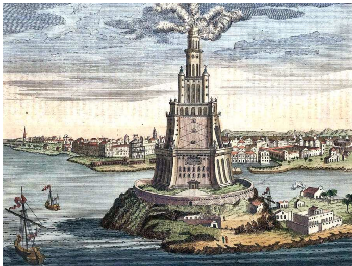
Ancient Alexandria, Egypt, with Pharos lighthouse

In 331 B.C., Alexander renamed an Egyptian town located along the Mediterranean Sea after himself: Alexandria. The city became a chief center for Hellenism (eclectic Greek culture) and housed the largest Jewish community in the world at that time.