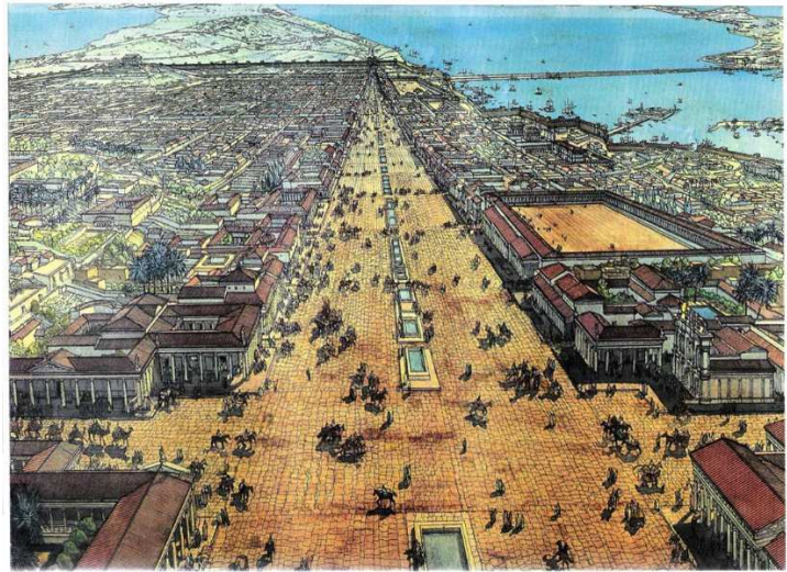
Ancient Alexandria, Egypt

[ https://external-content.duckduckgo.com/iu/?u=https%3A%2F%2Fcdn.britannica.com%2F07%2F172307-120-30BB78AE.jpg&f=1&nofb=1 ]