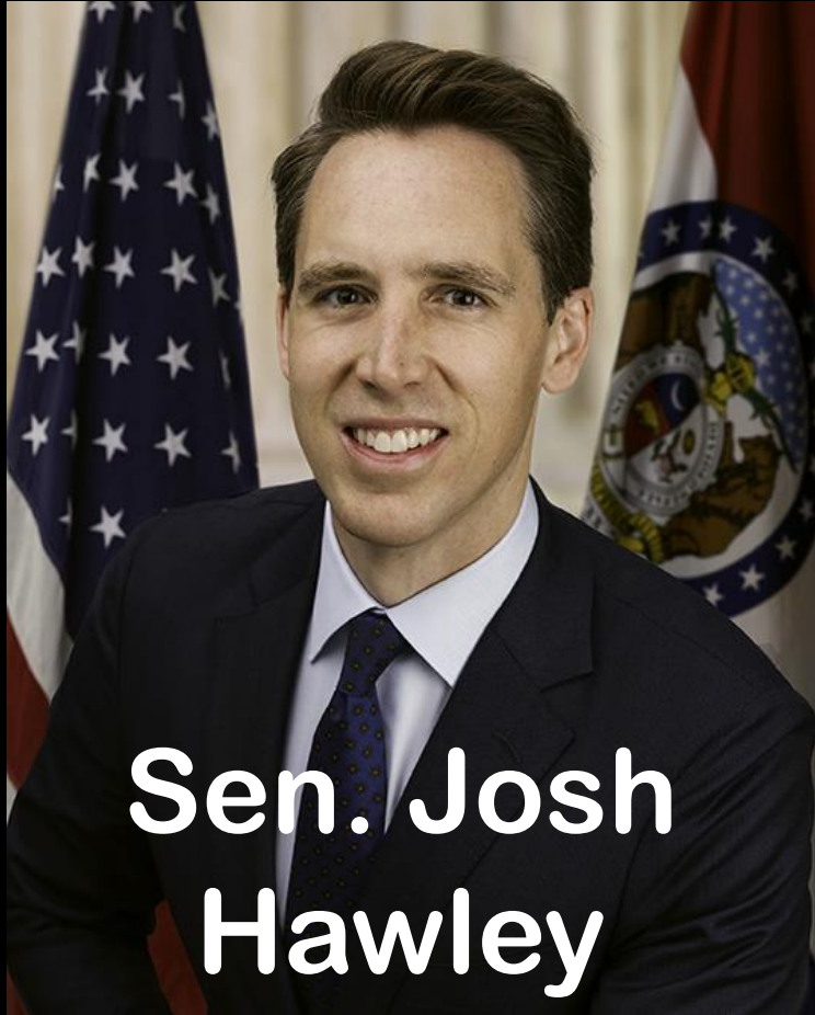
Sen. Josh Hawley