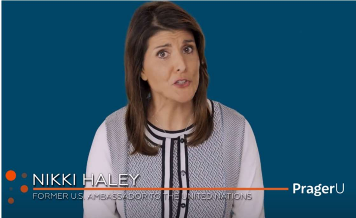
Capitalism Wins 6-minute video

I know that to people outside the state, it sounds like something that’s really terrible. But what I want people to understand is that Bamberg, SC, is the same small town that stopped segregating the princesses after that, that took black girls and white girls in the Girl Scouts and that allowed me on the tennis team. I wanted the takeaway not to be that I was disqualified from the pageant but what the town did after the pageant. [ https://www.nytimes.com/2011/03/06/magazine/06talk-t.html ]