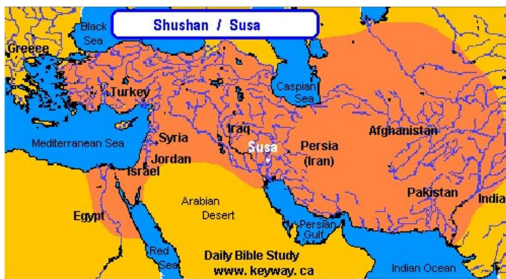
The Persian Empire

When the holiday of Purim was set for the 14th of Adar, the sages instituted that Shushan residents perpetually observe Purim on the 15th of Adar — the day when the Shushanite Jews celebrated. The 15th of Adar is hence known as “Shushan Purim.” Along with Shushan (which is located in modern-day southwestern Iran), all cities that were walled at the time when the Israelites, under the leadership of Joshua, entered Canaan, observe Purim on the 15th. Today, the only city that we are certain had walls in Joshua’s times is Jerusalem.