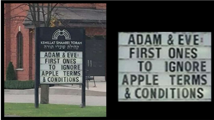
[from Yizraela Hiatt]