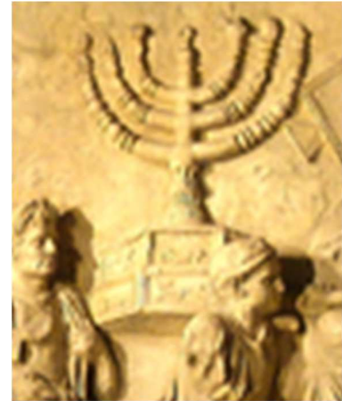
The menorah on the Arch of Titus in Rome