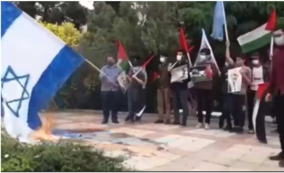
The Ruakh / wind defends Israeli honor ... 9-second video at https://worthy.watch/be-careful-if-you-decide-to-burn-a-flag

https://www.lifestyle-a2z.com/the-most-hilarious-photos-captured-at-the-airport-3/7/?xcmg=1