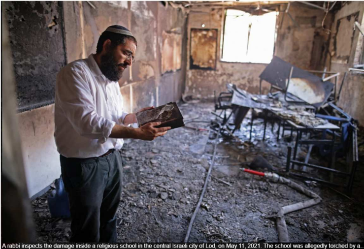
A rabbi inspects the damage inside a religious school in the central Israeli city of Lod, on May 11, 2021. The school was allegedly torched by a...

[ https://zionsglory.activehosted.com/index.php?action=social&chash=99c5e07b4d5de9d18c350cdf64c5aa3d.752&s=80ef67840a49f350765635c6ffe2a5ec ]