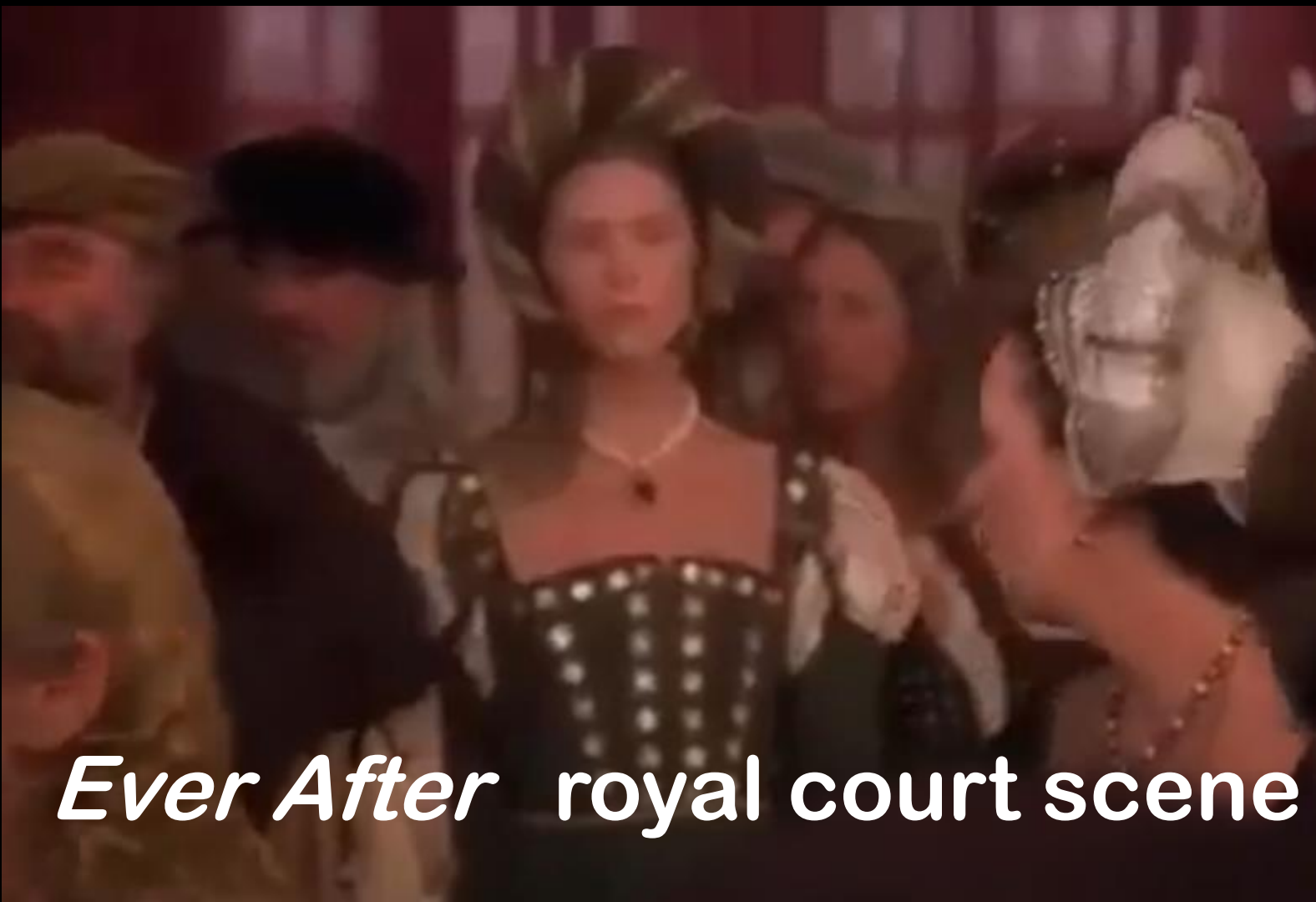
Ever After royal court scene