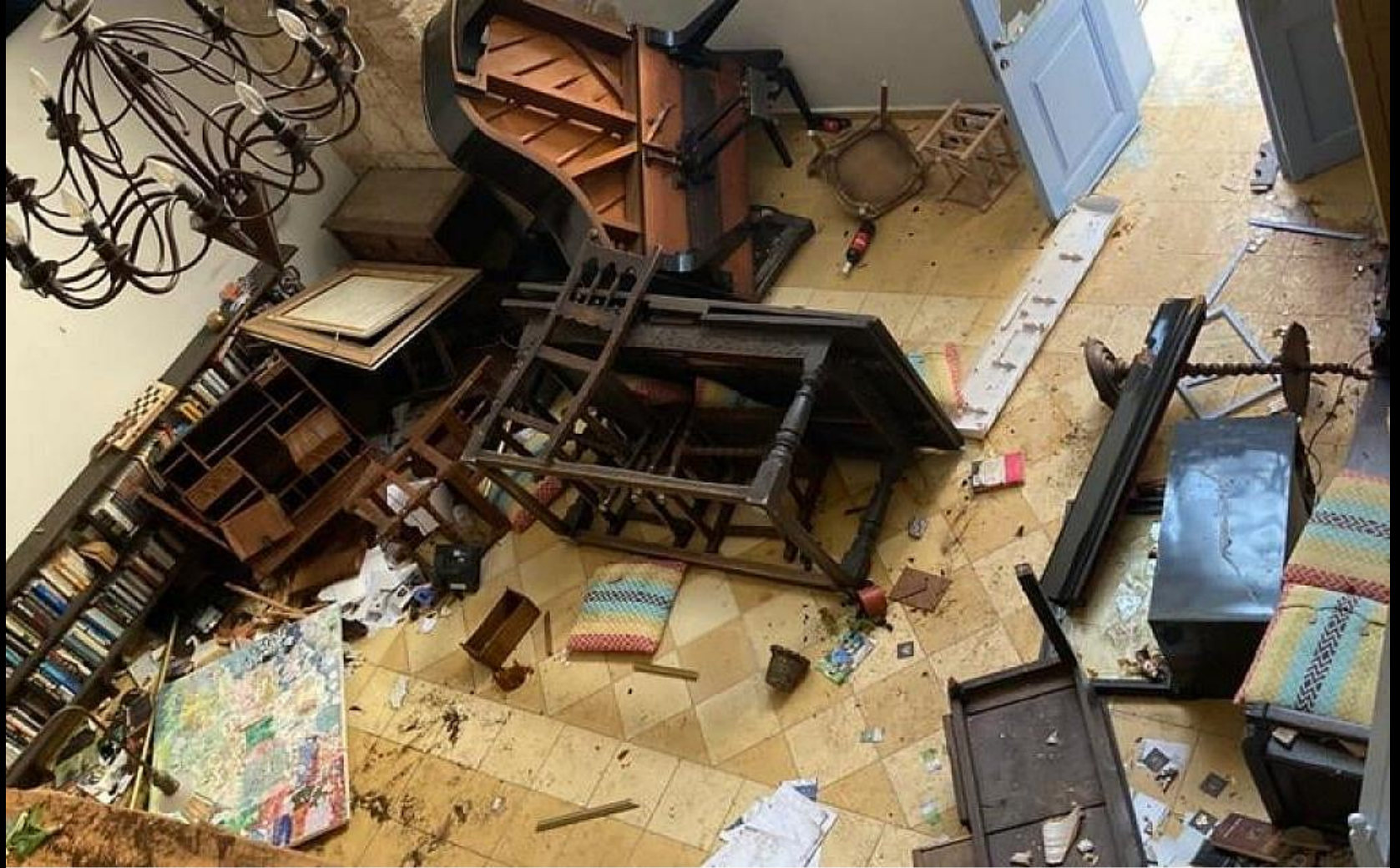
Damage caused by a violent mob at the Arabesque Arts and Residency Center in Acre, May 12