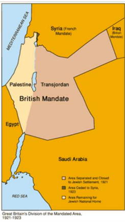
Great Britain's Division of the Mandated Area, 1921-1923

[ https://www.jewishvirtuallibrary.org/when-churchill-severed-transjordan-from-palestine/ ]