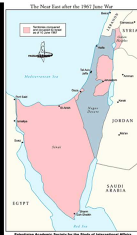
Palestinian Academic Society for the Study of International Affairs (PASIS)

Sinai given to Egypt. Gaza given independence → Hamas. Now international attempts to divide Judea, Samaria (West Bank) from Israel.