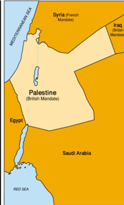
Area Allocated for Jewish National Home San Remo Conference, 1920

Winston Churchill liked to boast that in 1921 he created the British mandate of Transjordan, the Kingdom of Jordan, "with the stroke of a pen, one Sunday afternoon in Cairo."