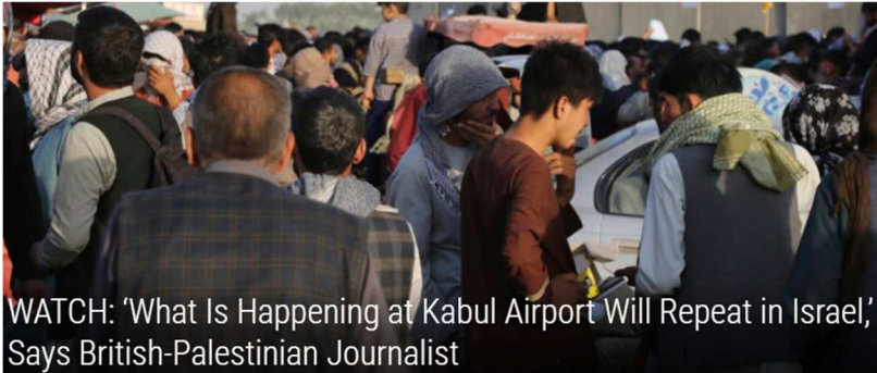
WATCH: 'What Is Happening at Kabul Airport Will Repeat in Israel,' Says British-Palestinian Journalist

Damascus, Azah אֲזַח Gaza, Tzor/Tyre, Edom, Amon, Moav, Yehuda, Israel.