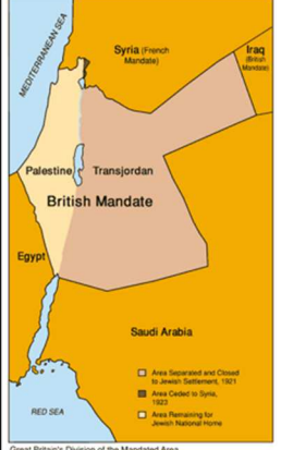
Great Britain's Division of the Mandated Area, 1921-1923

Winston Churchill liked to boast that in 1921 he created the British mandate of Transjordan, the Kingdom of Jordan, "with the stroke of a pen, one Sunday afternoon in Cairo."