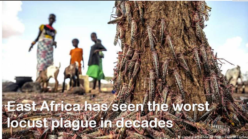
East Africa has seen the worst locust plague in decades

THIRD Mtt. 24.6-14 At that time you will be arrested and handed over to be punished and put to death, and all peoples will hate you because of me.