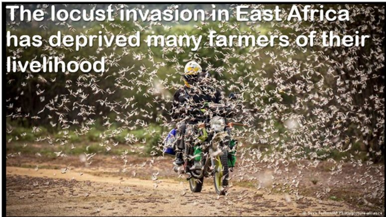
The locust invasion in East Africa has deprived many farmers of their livelihood

[ https://www.dw.com/en/east-africa-braces-for-a-return-of-the-locusts/a-56133496?maca=en-rss-en-all-1573-xml-mrss ]