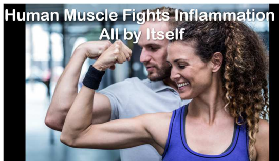
Human Muscle Fights Inflammation All by Itself