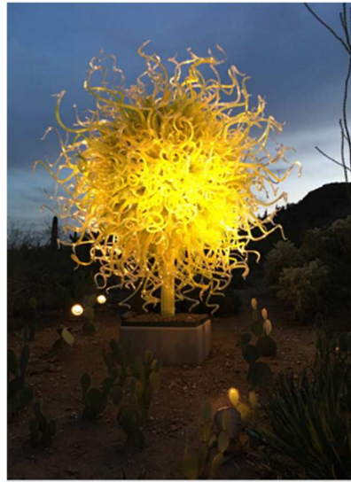
Glass sculpture by Dale Chihuly