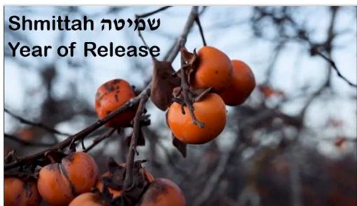
Shmittah שמיטה Year of Release

[https://womenswisdom.net/beauty-tips-by-audrey-hepburn/]