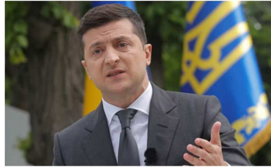
For Many Jews Watching Ukraine's War, Volodymyr Zelenskyy is a 'Modern Maccabee'

[ https://youtu.be/l7CfoDByXso ] 1.5-minute video