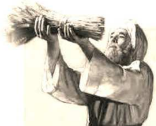
An ancient cohen /priest waving the barley

[First fruits of the barley harvest. Wheat is not up yet.