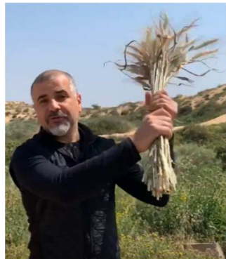
Israel Pochtar Beit Hallel, Ashdod, Israel

[ https://3.bp.blogspot.com/-qC9g8Y0pkIE/WBKABmcwaki/AAAAAAAAEPw/4f5ucuJdVzslJAsWF4-Sv7QqgFMk_EkQQCLcB/s320/Wave-offering1.jpg ]