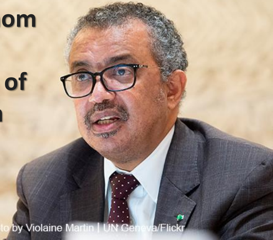
Dr. Tedros Adhanom Ghebreyesus

Dr. Tedros Adhanom Ghebreyesus, Director-General of the World Health Organization since 2017.