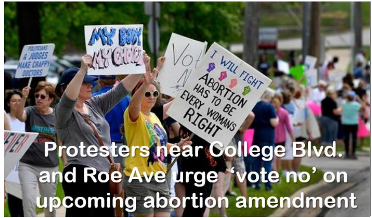
Protesters near College Blvd. and Roe Ave urge 'vote no' on upcoming abortion amendment

[ https://www.newsbreak.com/news/2648605991691/protesters-in-overland-park-tell-kansans-to-vote-no-on-upcoming-abortion-amendment?s=oldSite&ss=dmg_local_email_bucket_13.web2_fromweb ]