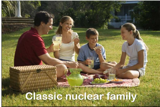
Classic nuclear family