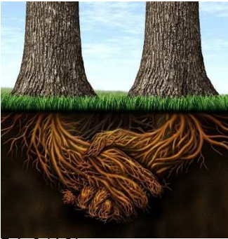
Spirit of Sequoia roots

[ https://external-content.duckduckgo.com/iu/?u=https%3A%2F%2Fpining.com%2Foriginals%2Fec%2F8c%2F52%2Fec8c525b4cbd434a4e918dabff4ac03.jpg&f=1&nofb=1&ipt=0be114f23f60ef1b4bf99bf87120a7a68467722491c1494a57027b669eb6c341&ipo=images ]