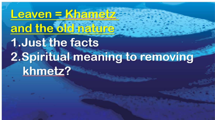
[So intense that European Jews added a day and added leaven look-alikes?]

<sup>1 Cor 5.6-8</sup> Don't you know the saying, "It takes only a little hametz to leaven a whole batch of dough?" Get rid of the old hametz , so that you can be a new batch of dough, because in reality you are unleavened.