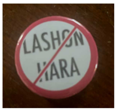
אזור חופשי לשון הרע

In Proverbs 16:27, gossiping lips are likened to a 'scorching fire,' and in v. 28, those with loose lips are referred to as 'perverse' because they 'separate close friends' (TLV).