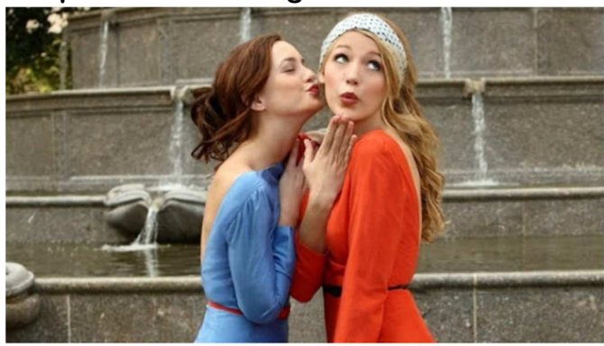
Stop the Spread of Evil Speech

[https://ci3.googleusercontent.com/meips/ADKq_NamDMSOjrM8Q15OsjUnxMwxQo7RgtyZHrtLdF8wv9HDrOdp1Lk5PzGD33xZCmC_vf_5Pb7m6ar2C CnIDEtaiuxkQBID0Wsnj0MCLXWqSy8o7JL08THwDcl3f1YzAHqZ5xZsppMs7xtUc2ZE3SEWJbTPBg=s0-d-e1ft#http://staticapp.icpsc.com/icp/resources/mogile/113437/7566846a55b333afdfa90b5869e07b4e.jpeg]