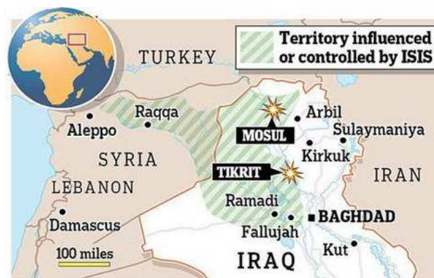
Map with towns under the control of the Islamic State in Iraq and Syria.

[Modern Lebanon, Syria, Iraq, Jordan artificial. The agreement is seen by many as a turning point in Western–Arab relations. It did negate the promises made to Arabs [39] through Colonel T. E. Lawrence for a national Arab homeland in the area of Greater Syria, in exchange for their siding with British forces against the Ottoman Empire. The agreement's principal terms were reaffirmed by the inter-Allied San Remo conference of 19–26 April 1920 and the ratification of the resulting League of Nations mandates by the Council of the League of Nations on 24 July 1922.]