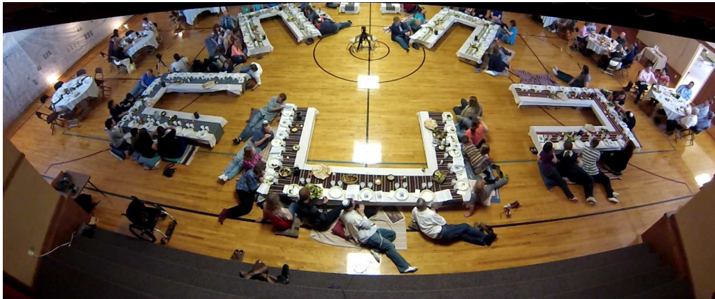
[Triclinium table attempt, http://2.bp.blogspot.com/-BzZt8e7v5m4/U5E24PDAYOI/AAAAAAAAABya/15IH4YP8JF0/s1600/Passover-biblical-dinner.jpg ]

Levi/Matityahu had a transformation, and wanted to share, and celebrate. Made a party, sort of the essence of following Him. Invite, feed, give, serve.