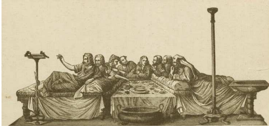
[Triclinium table, http://2.bp.blogspot.com/-S-2PSL4Ozys/UzEn5DKIwDI/AAAAAAAAABaM/zgka153xv1U/s1600/Re-Dining+table+and+couches.++Roman+triclinium++(1885).jpg ]