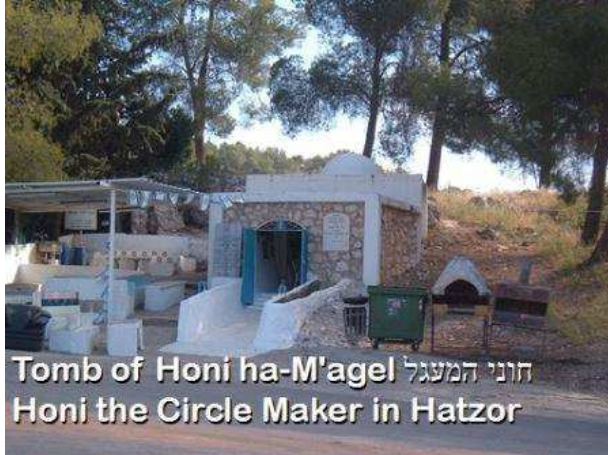
Tomb of Honi ha-M'agel חוני המעגל Honi the Circle Maker in Hatzor

there." Seven times he said, "Go again." The seventh time, the servant said, "Now there's a cloud coming up out of the sea, no bigger than a man's hand." Eliyahu said, "Go up, and say to Ach'av, 'Prepare your chariot, and get down the mountain before the rain stops you!'" A little later, the sky grew black with clouds and wind; and heavy rain began falling;