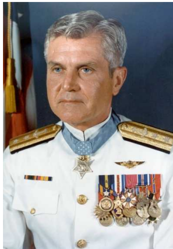
Rear Admiral James Stockdale in full dress white uniform Dec. 23, 1923 – July 5, 2005

[Transition: Serious and gripping story that illustrates the message.]