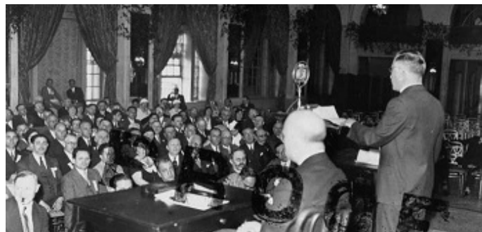
Delegates at the Evian Conference, 1938

A bit of history to explain a miracle...]