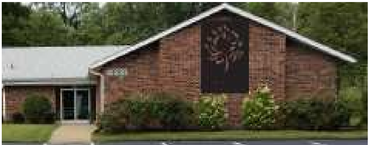
stainless steel sheet and colored, backlit logo and words

How is an apple like a train [in Spanish]?