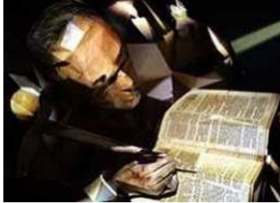
Professor George Bush 1796 - 1859

George Bush was an ordained Presbyterian minister and professor of Hebrew and Oriental Literature at New York University. He was convinced of the truths of the Biblical prophecies of Israel's return to their land and became a national voice calling for the restoration of the Jewish people: "The dispersed and downcast remnant shall, one after another, turn their faces to Zion ... find their way to the land of their fathers....This will not only benefit the Jews, but all mankind, forming a link of communication between humanity and God." In 1844 he published his views in a landmark book entitled "The Valley of Vision; or, The Dry Bones of Israel Revived," based on the prophecies of Ezekiel in the Bible. "The Valley of Vision" sold more than a million copies, unheard of in the era before the Civil War. It turned Bush into a national voice calling for the restoration of the Jewish people to their historic homeland.