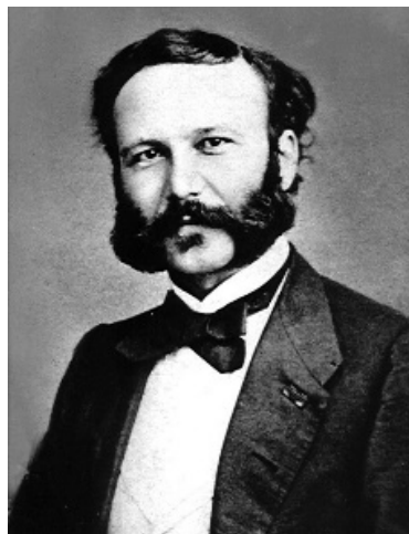
John Henry Dunant 1828-1910

[ https://www.fozmuseum.com/exhibits/dreamers/bush/ ]