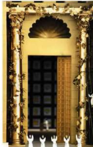
The Golden Vine

[ https://www.google.com/search?q=golden+vine+of+the+Jerusalem+Temple&safe=active&source=Inms&tbm=isch&sa=X&ved=0ahUKEwj7ue3Kx9_ZAhWLOFMKHcLTC6kQ_AUIDCgD&biw=1282&bih=933#imgrc=AbD6B9jYL7UN2M: Adding gold leaves: invested, sort of collateralized your word in the leaves.]