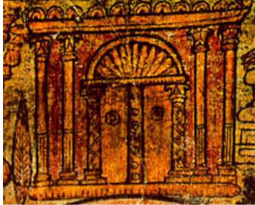
Probable Depiction of Temple from Dura Europus

A few centuries of memory, much better than a few millennia!]