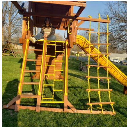
two views of our new Big House on the playground