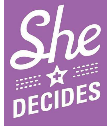
MY BODY MY CHOICE

[Makes anti-abortionists look like negativists. Against choice. Hurt and defensive people.]