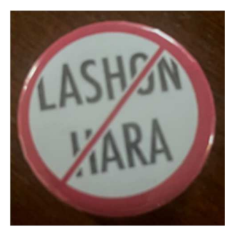
אזור חופשי לשון הרע Azor khofshi Lashon HaRa Defamation-free zone