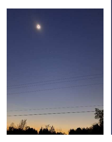
From Jim Templer in Mt. Pleasant, Arkansas.