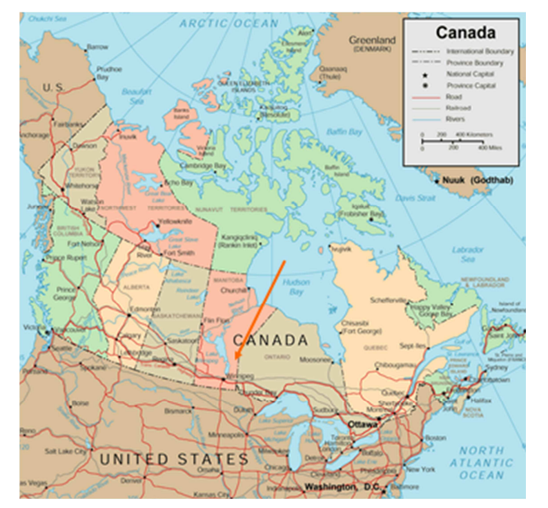
[Gets to be -40° F [F and C come together that cold] Nevertheless, large city.]

Illustration of this from our 6 years in Winnipeg, Manitoba, Canada.]