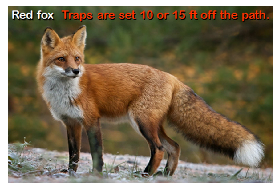
[There are paths in the forest. Trail bicyclists use them. Picture the fox above, on the path, and he smells something...something...]