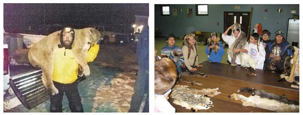
[Me at age 30. Well, maybe not.]

[Trapping still big business. People trapped animals for their pelts and traded them at the Hudson Bay Store, still in business. Founded 2 May 1670 Red fox in 1980's $60. Trading pelts at the Bay Store for merchandise: 1980's, so traded pelts for satellite dishes, VCR's, canned goods, tools. Satellite dish and an outhouse!]