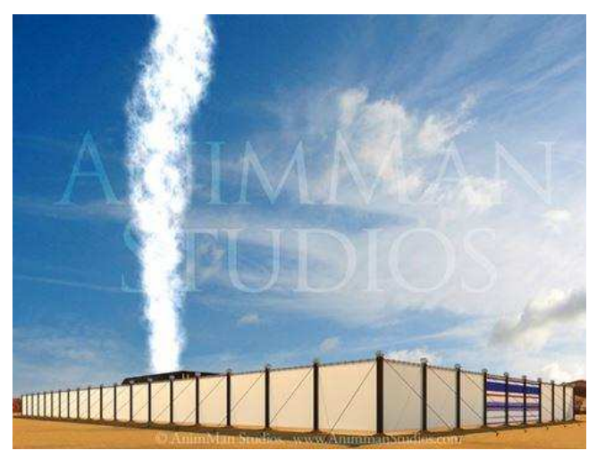
[Cloud by day, got fiery at night.]

Bamidbar/Nu 9.15-17 Whenever the cloud was taken up from above the tent, the people of Isra'el continued their travels; and they camped wherever the cloud stopped.