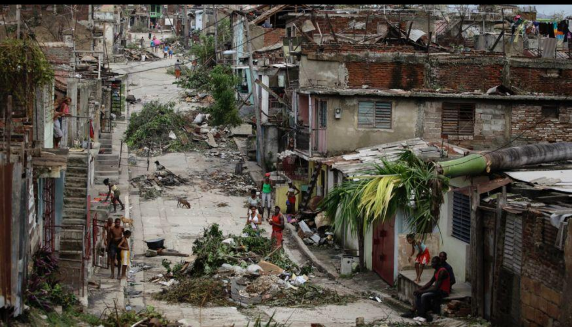
A view of Cuba, 2015