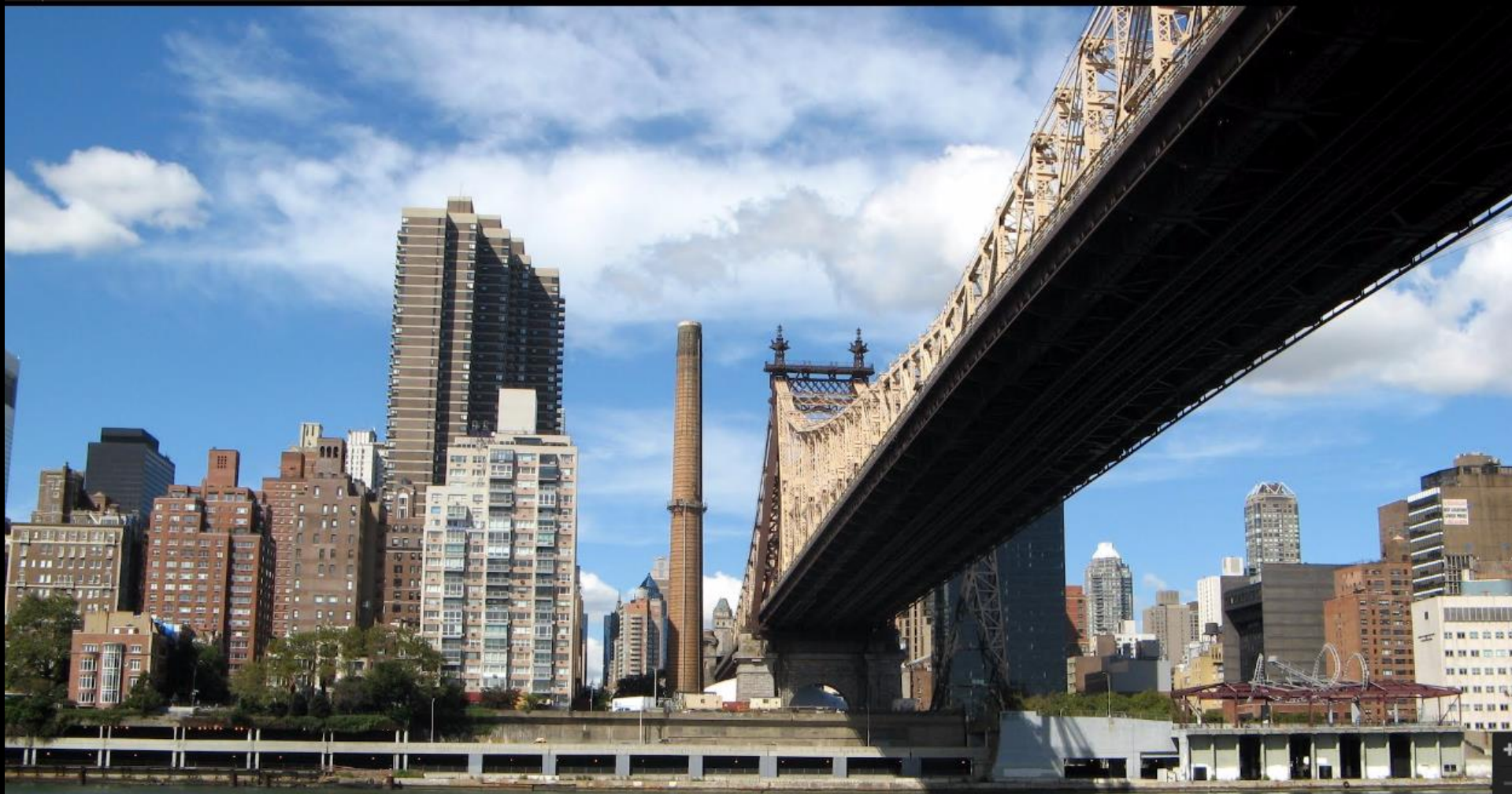
59th Street Bridge, New York, ...