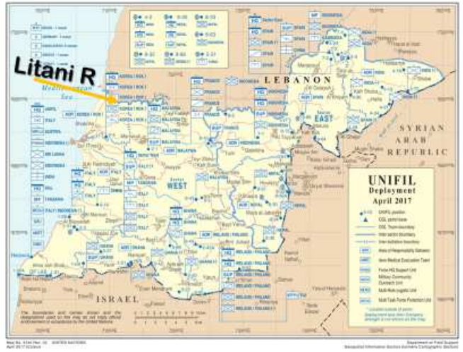
[Troops of various nations positioned in S. Lebanon

Colored points are mostly weapons caches.]