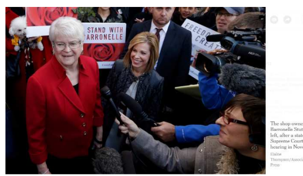
Cake decorator convicted of discrimination for refusing to make cake for gay wedding.

[Some current examples of suffering before success, (not equivalent to Y)]