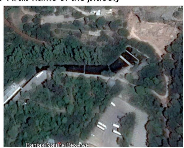
[Google earth. Note the cave at the top of the screen. Was the source of the Jordan previously. Still near it.]

Mattityahu (Matthew) 16:13 כְּשֵׁבָּא יֵשׁוּעַ אֱל סְבִיבוֹת קֵיסַרְיָה שֵׁל פִילִיפּוֹס