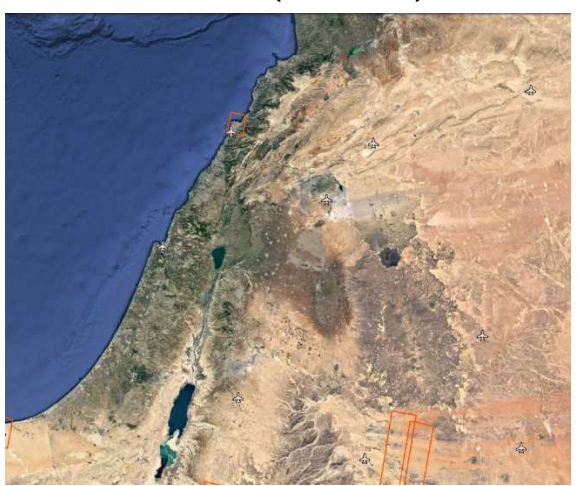
[Google earth next is a big zoom in, north of Yam Kinneret, Sea of Galilee]