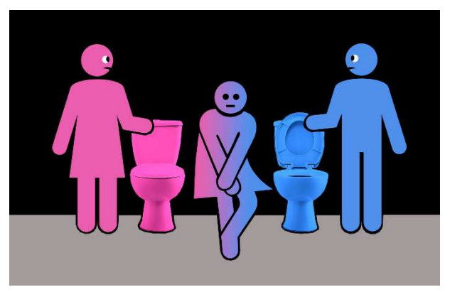
[Hard to find a good illustration that wasn't obscene. I am pretty regularly in a locker room at the J. The standard attire...Women in there who think they are guys!! Note: Seat up or seat down.]