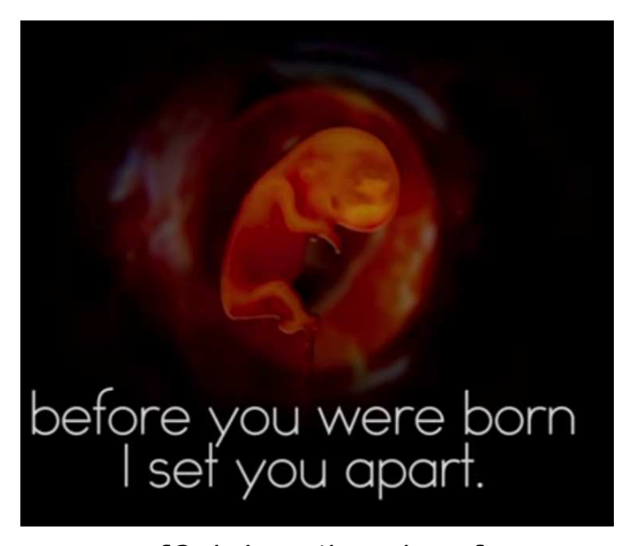
[G-d chose the unborn.]