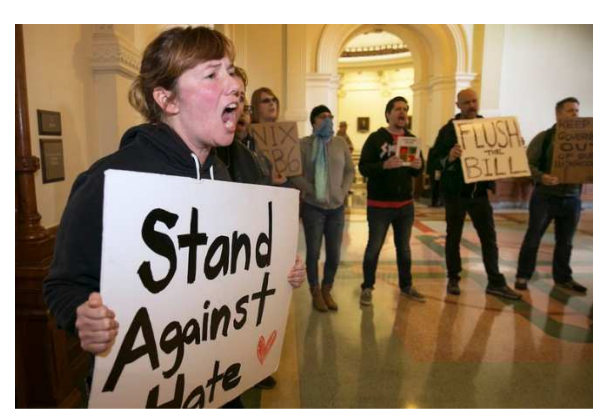
["Protect transgender people" Seems reasonable.]