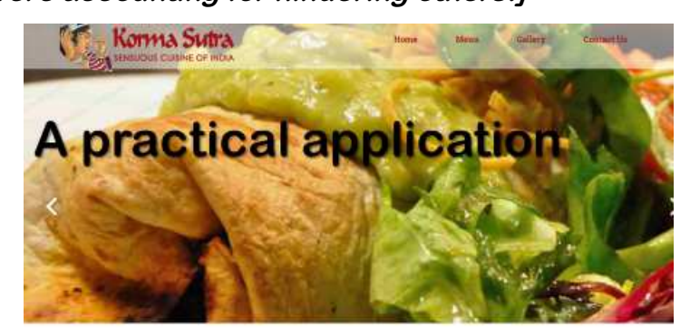
Welcome to Korma Sutra :: Indian Dining & Catering

[So, there is severe accounting for hindering others.]