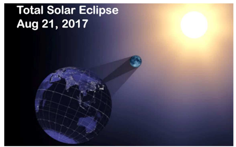
[Penumbra → partial eclipse umbra = totality, small shadow Every 400 years given location]