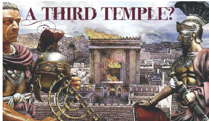
[ http://metrovoicenews.com/kansas-city-archives/ ]

Last week I shared the Rev 12 astronomical phenomenon. Don't know what it means, but here's another.]