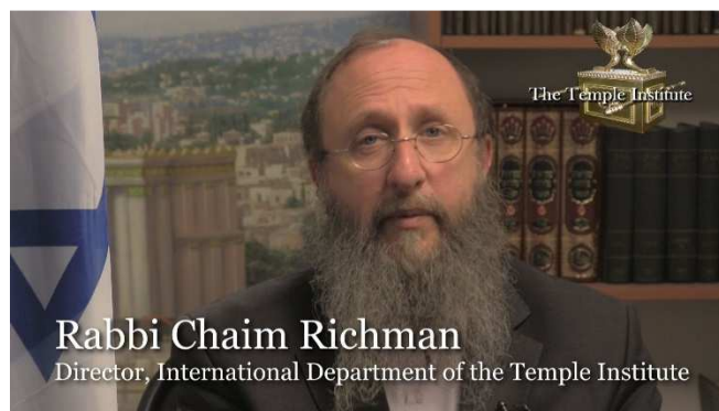
[During the Second Intifada, approx, 2003, we visited the Temple Institute.]