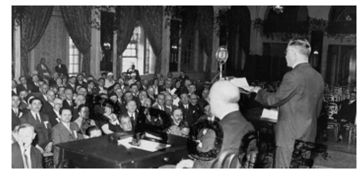
Delegates at the Evian Conference, 1938 [http://www.holocaust.com.au/The-Australian-Experience/Before-the-War/Evian-Conference]

A bit of history to explain a miracle...]