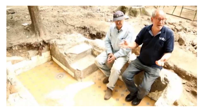
Ritual bath destroyed by Nazis uncovered in Vilnius, Lithuania