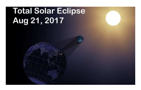
[You've seen this slide a lot. Last time till 400 years from now!]

During totality, the eclipsed sun is no brighter than the full moon, and it is an experience you simply will not believe.