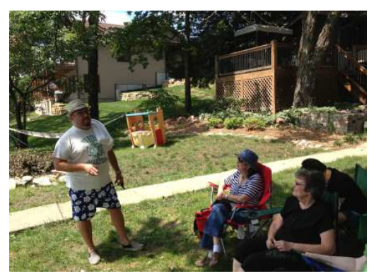
[Each person has a little time to share their testimony.]

It is customary to immerse fully - covering every strand of hair with water - a total of three times.