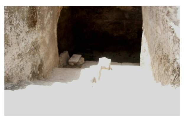
[On the street immediately west of the Temple Mount. Steps going down, and no touchy steps going up, not to be contaminated.]