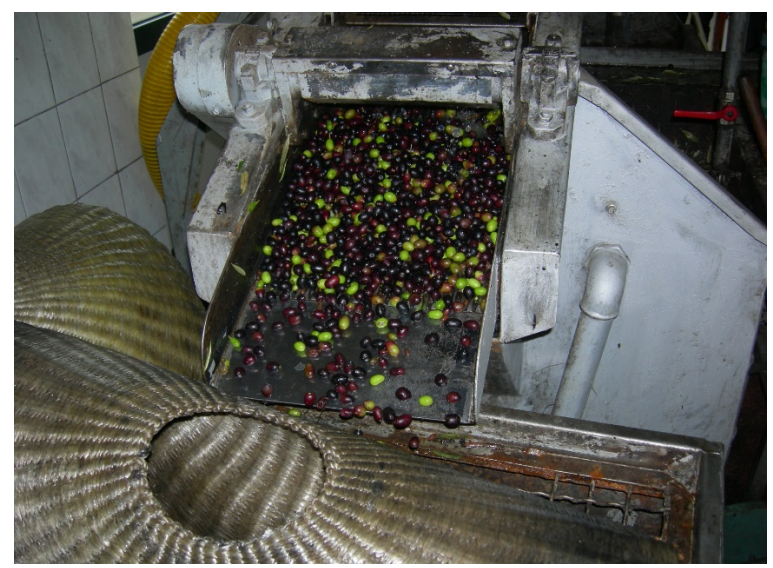
[https://en.wikipedia.org/wiki/Olive_oil#/media/File:Frantoio_Maraldi_2.JPG Still using wicker baskets]

and was consecrated for use only in the Temple by the priests and stored in special containers. Another use of oil in Jewish religion was for anointing the kings and prophets of the Kingdom of Israel, originating from King Shaul. Tzidkiyahu was the last anointed King of Israel. [https://en.wikipedia.org/wiki/Olive_oil]