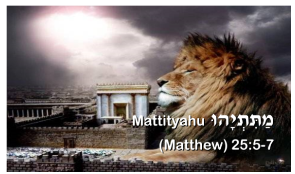
[Continuing the somewhat enigmatic story of the 5 bridesmaids waiting for the bride. They had insufficient oil.]

Mattityahu (Matthew) 25:5 בַּיָןן שֶׁהִתְמַהְ הֶחָתָן נִמְיְמוּ. בַּיָןן שֶׁהִתְמַהְמַה הֶחָתָן נִמְיְמוּ כֵּלֶן וְנִרְדְמוּ.