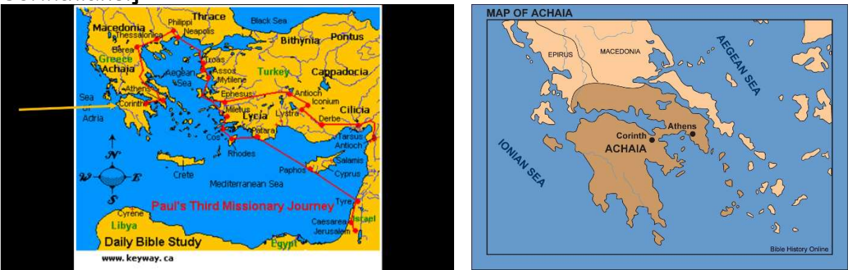
[https://www.google.com/search?q=corinth+greece+map&safe=active&tbm=isch&source=iu&ictx=1&fir=msYKT9XjR5k D8M%253A%252Cv6pLRI1FzqxmBM%252C_&usg=_XeGf2BPOGqzBGByE3FG17GPVah0%3D&sa=X&ved=0ahUKEwiuup 3B94PaAhWKuIMKHfq8DBEQ9QEILTAB#imgdii=72Sq4EaxYRRjIM:&imgrc=z21IFcu5hYHIQM: What nationality in Corinth? Some Jews, MOSTLY Greeks!]

Wait a minute. Passover is only for Jews. Really? Look at the reference ... Corinthians.]