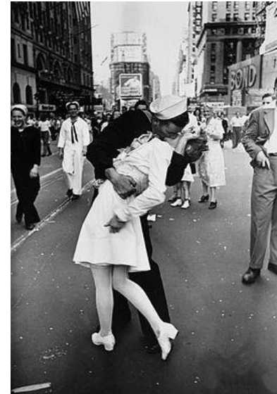
1V-J Day in Times Square, a photograph by Alfred Eisenstaedt, was published in Life in 1945 with the caption, "In New York's Times Square a white-clad girl clutches her purse and skirt as an uninhibited sailor plants his lips squarely on hers"

55. promised to our fathers... Yermiyahu/Jer 31.9-11, 34-35 Nations, hear the word of ADONI ! Proclaim it in the coastlands far away. Say: “He who scattered Isra’el is gathering him, guarding him like a shepherd his flock.” For ADONI has ransomed Ya’akov, redeemed him from hands too