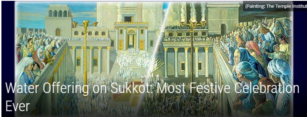
(Painting: The Temple Institute)

One of the highlights of the holiday of Sukkot in the Holy Temple was the celebration of the special Water Offering, known as Simchat Beit Hasho'eva . As part of this incredibly festive event, the people would gather every afternoon of