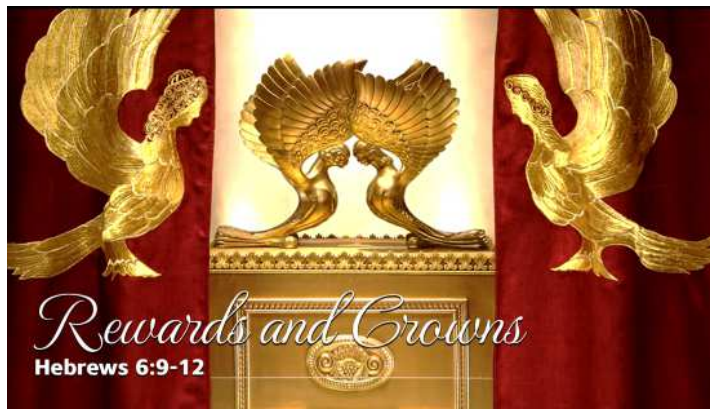
[Talk to you about the roller coaster ride in Ch 6]

<sup>MJ 6.9-12</sup> Now even though we speak this way , dear friends, we are confident that you have the better things that come with being delivered. For God is not so unfair as to forget your work and the love you showed for him in your past service to his people — and in your present service too. [What way is he speaking? We'll come back to that.]