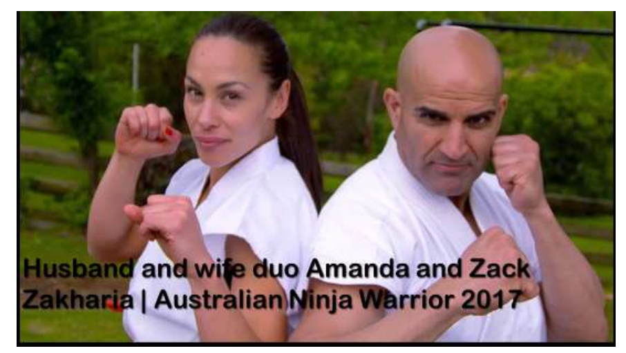
[https://youtu.be/eJHwUruZYag They have each other's back! Pray, serve, give, love TOGETHER!!]

song of Songs 2.13-15 The fig tree ripens its early figs. The blossoming vines give off their fragrance. Get up, my love, my beauty, and come, come! My dove, in the clefts of the rock, in a secret place along the steep path, let me see your form, let me hear your voice. For your voice is sweet and your form is lovely." Catch the foxes for us — the little foxes that ruin the vineyards, for our vineyards are in blossom. [A great fighter for Messiah the King ...]