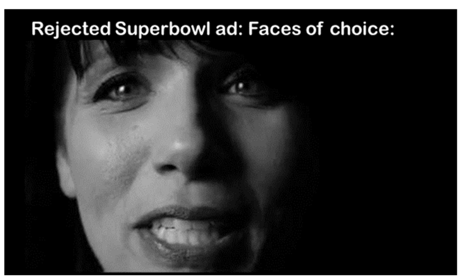
This was a proposed Superbowl halftime ad that was rejected. 2-minute video https://www.youtube.com/watch?v=hm24p8cBPKQ

For the wedding of the Lamb has come, and His bride has made herself ready, She was given fine linen to wear, bright and clean! For the fine linen is the righteous deeds of the holy people kedoshim."