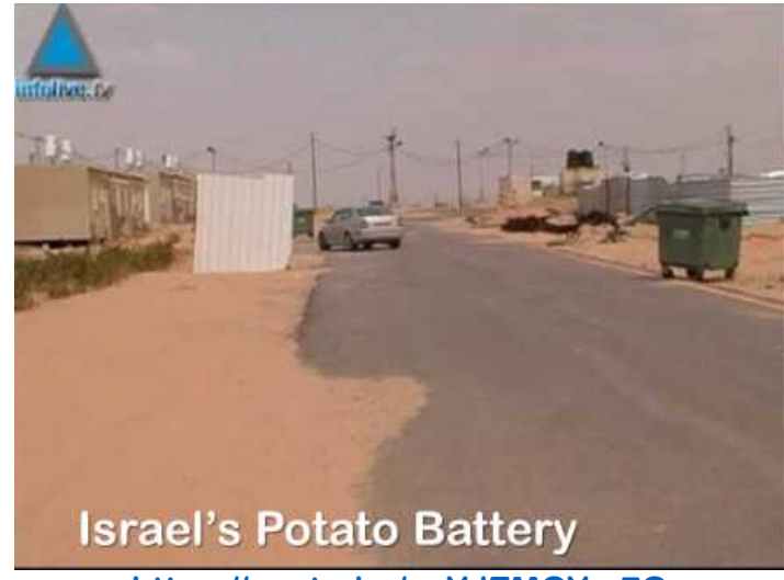
https://youtu.be/yoYdEMOYm7Q from Blaine Robison: 42-second video